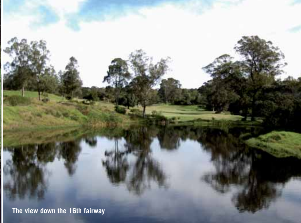
The view down the 16th fairway