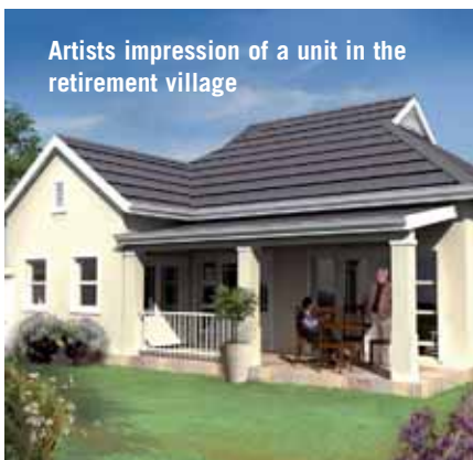
Artists impression of a unit in the retirement village